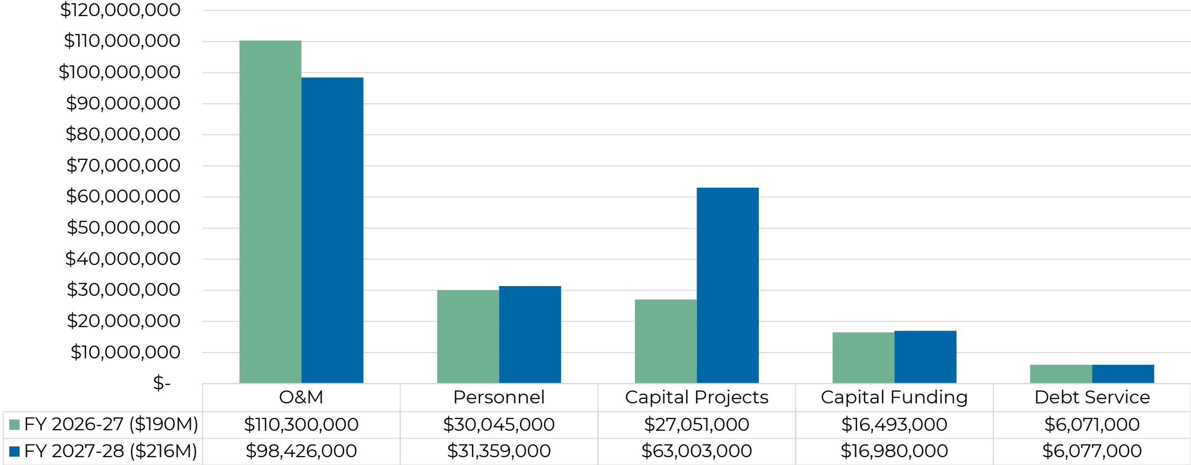
Agency-wide Expenses by Category